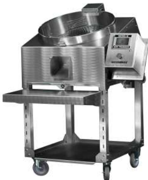
Model M Dry Trimmer